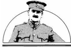
Colonel Stephens Society