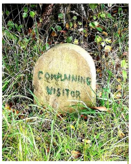
Seen in National Trust property in Durham